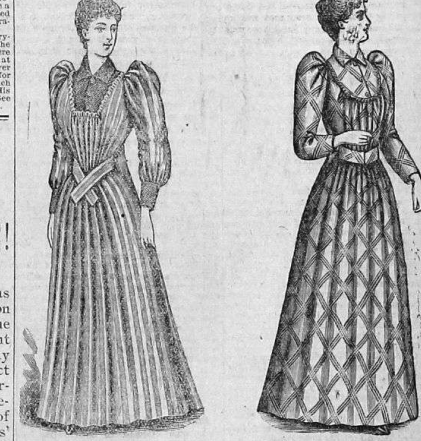
Handsome gingham wrapper made in pretty stripes, with collar, yoke and cuffs made of chambray to match, full pleated back. Made of percale cloth, in just this plaid pattern, of pink, blue and black. Circle yoke all around, headed to match. Gathered full in the back from circle yoke, making skirt very full.

Though many we have, but two styles are shown here: