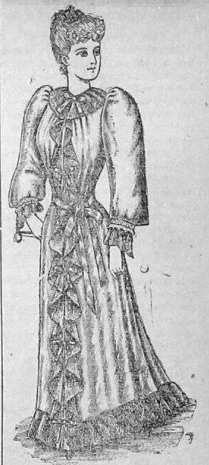
Special Sale of Tea Gowns This Week.

As these illustrated Cloak pictures tower above all others in this or any others paper in the civilized world today, do we 5'er above all alleged aspirants to the Cloak Trade of this city. Our great sale continues to flourish. The good people of this great city are awakened to this important fact, that It Pays to Trade with an EXCLUSIVE CLOAK HOUSE. We are a Unique Store among Grand Rapids stores. We are, FIRST, LAST and ALL THE TIME a CLOAK HOUSE. Every thought is a CENTERED CLOAK Thought. We do not study the furniture trade here, nor the crockery trade at Trenton, New Jersey, etc.; nor do we send your Cloak home in a wash boiler. We are fully aware that you appreciate our methods—never advertising an article unless we have sufficient to meet all Reasonable Demands. We are very much obliged to you for your appreciation, and when we don't merit it We'll STOP GROWING.