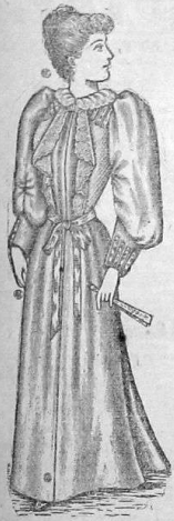
Special Suit Sale This Week.