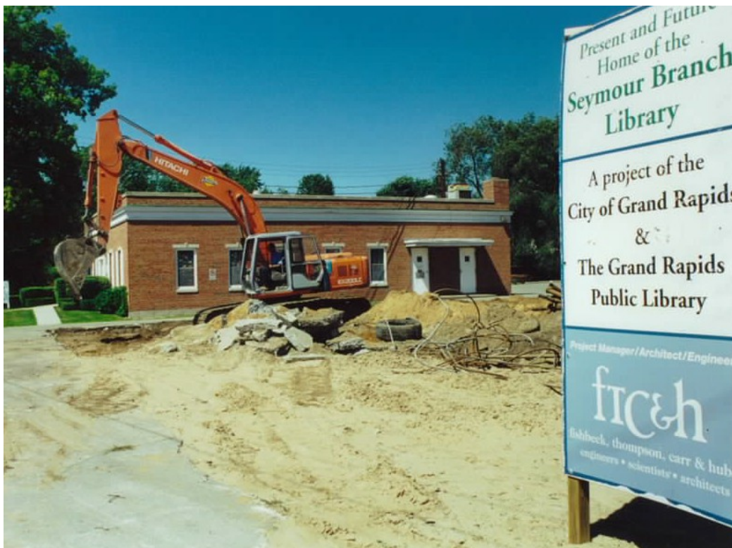
June 1999: Gas City is demolished to make more room for the “Present and Future home” of the Seymour Branch.