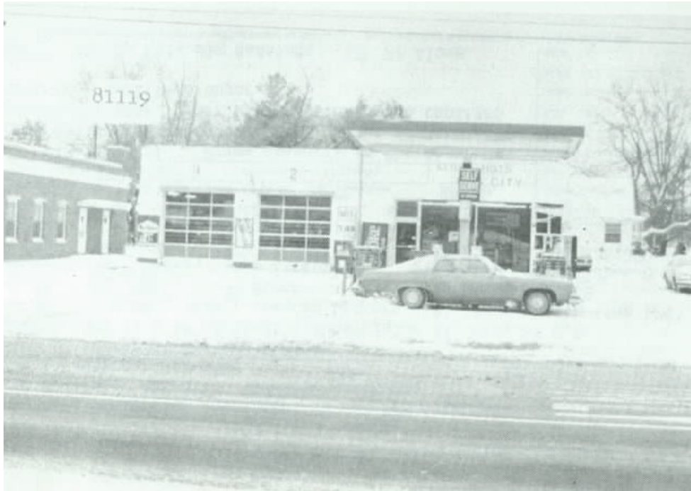
Pictured above is the 2354 address (Gas City) in December of 1983; the Seymour Branch at 2350 Eastern Ave. can be seen in the photo to the left.