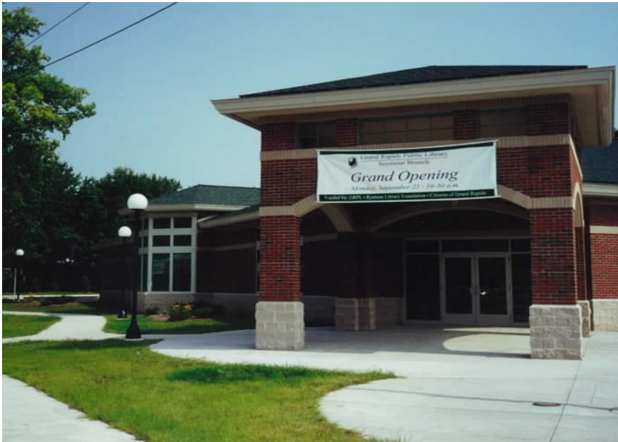
2350 Eastern Ave. SE - current home of the Grand Rapids Public Library Seymour Branch

A grand opening is held at the 2350 Eastern Ave. SE location for the new building, which provides more than 10,000 square feet of space. 6