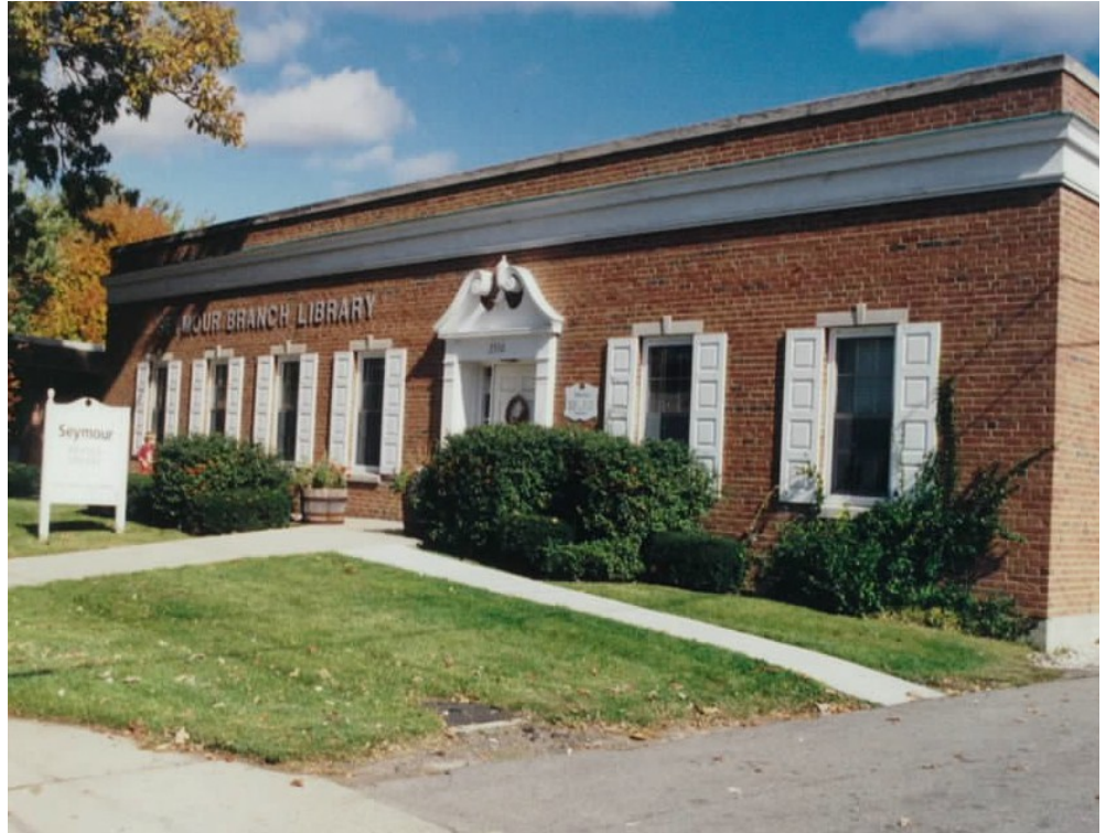
2350 Eastern Ave. SE, circa 1982—second location for the Seymour Branch